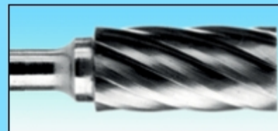
AL - PER ALLUMINIO