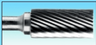
SC - TAGLIO STANDARD